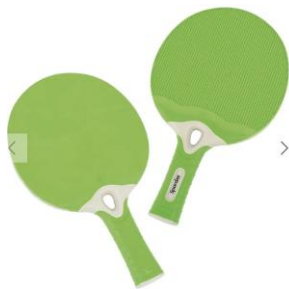
Table Tennis, Board Games and Puzzles.